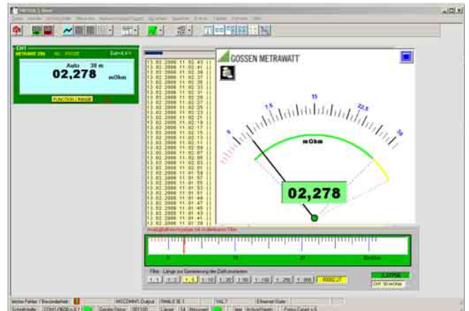
Figure 1: 1-channel display with table, view of measuring mechanism and bargraph with filter function